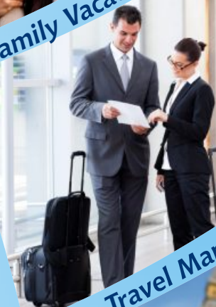
Business Travel Management