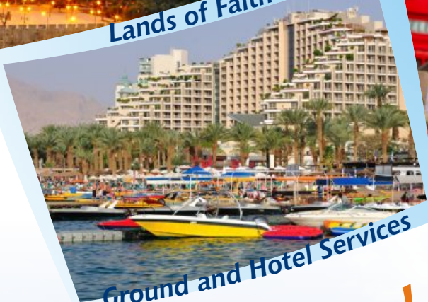
Ground and Hotel Services