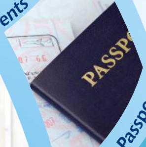
Visas & Passports