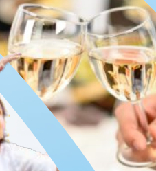
Events & Congresses